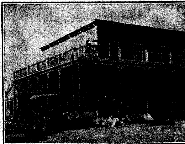
MONTGOMERY HOTEL, BEATTY

Telephone and Headquarters for Automobile Lines and Stages from Tonopah, Goldfield, Las Vegas and Other Camps